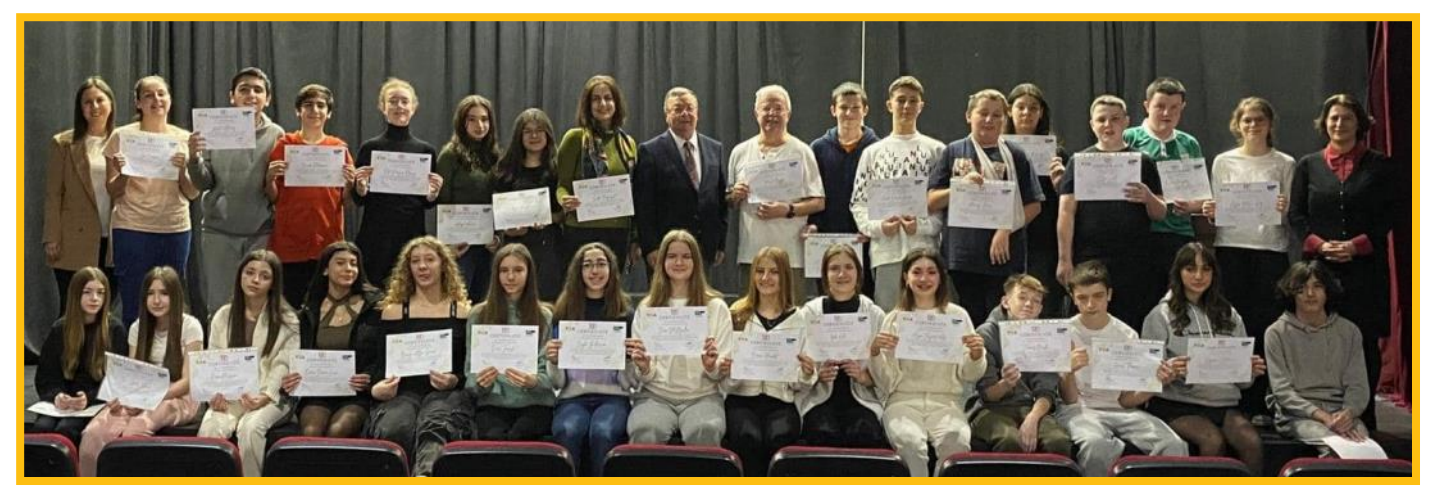
YBA pupils performed their drama work alongside their new Turkish friends, and all those involved were presented with certificates of participation.