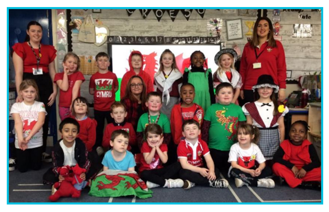
Our pupils dressed up in red, white and green