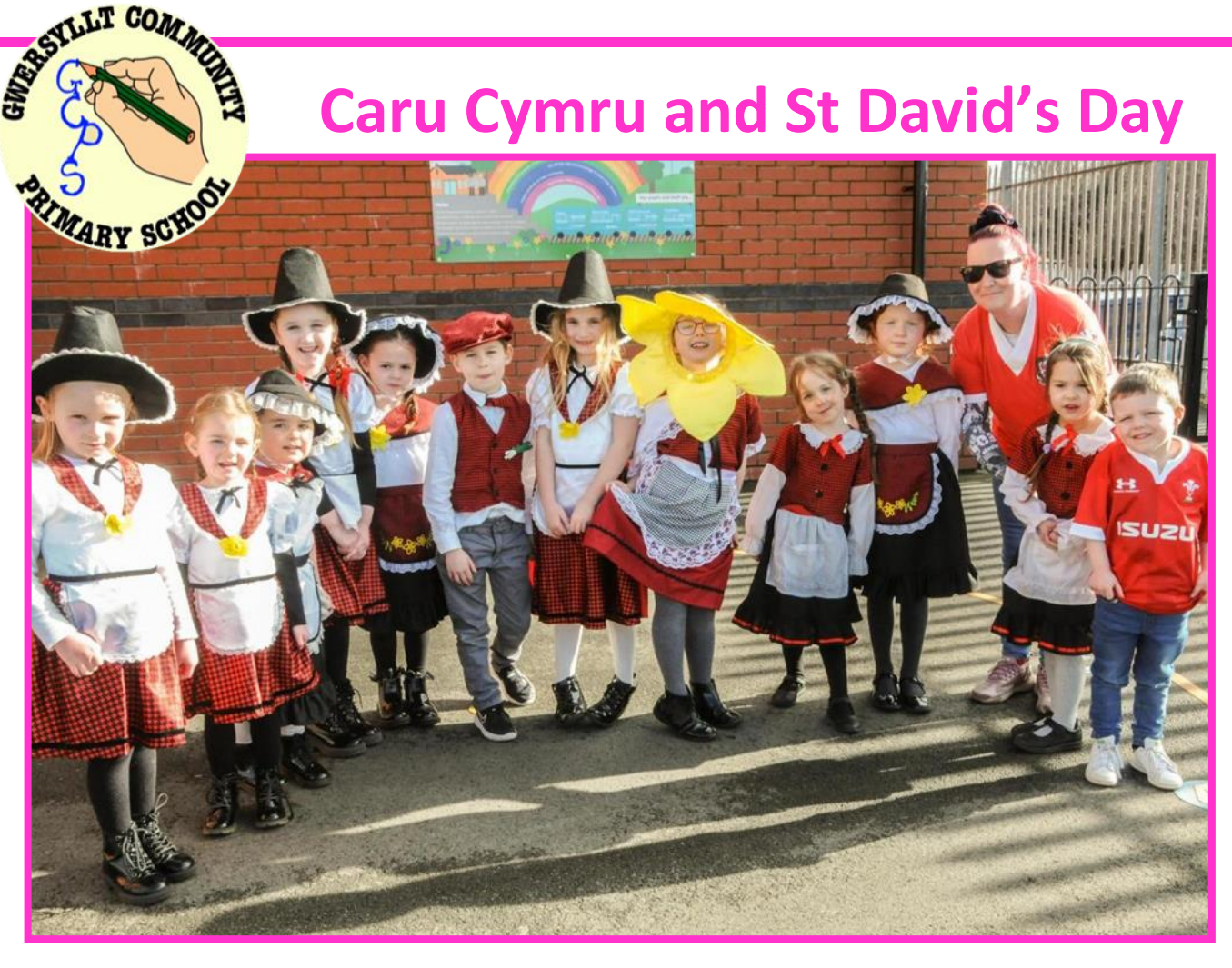
Here at Gwersyllt CP we went all out to celebrate being a school in Wales.

Of course, the big day was St David's day in which we held our annual Eisteddfod. We performed poetry, sang, played musical instruments and performed traditional welsh dances. The breadth of talent was amazing and gave us a great opportunity to showcase our creative skills at the end of our expressive arts topic.