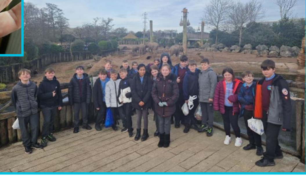
And the whole school completed workshops with staff from Chester Zoo, culminating in a visit to the zoo: