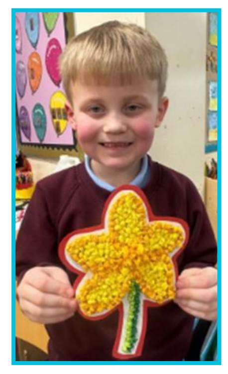
Reception created paper daffodils which will be included in a display in Llangollen

We celebrated St David's Day with an array of crafts and expressive arts activities.